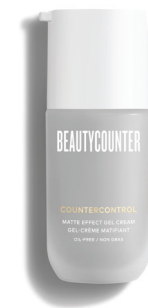
Matte Effect Gel Cream $43 USD | 56 CAD$

This invisible gel formula with maximum-strength salicylic acid penetrates pores to reduce blemishes and clear skin. SKU 100001032 US / 100001030 CAN 15 ml / 0.5 fl oz