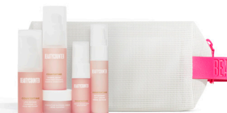
Countertime Carry-On Set $148 USD | 192 CAD$

This high-performance eye cream revitalizes the eye area and reduces the appearance of under-eye shadows and crow’s feet for a smooth, firmed look. SKU 100000236 15 ml / 0.5 fl oz