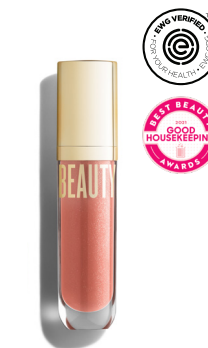
Beyond Gloss $32 USD | 39 CAD$

See page 7 for a list of shades. 40 ml / 1.35 fl oz