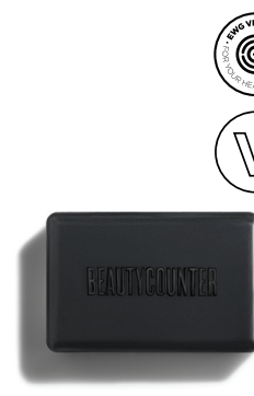
Charcoal Cleansing Bar $28 USD | 36 CAD$

This kaolin clay mask purifies and balances, absorbing excess oil and drawing out impurities. Salicylic and lactic acids aid in gentle exfoliation. SKU 100000851 60 ml / 2 fl oz