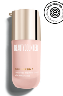
Countertime Tripeptide Radiance Serum $87 USD | 113 CAD$

This transformative, rejuvenating treatment visibly increases skin firmness and elasticity while reducing the appearance of fine lines and wrinkles.