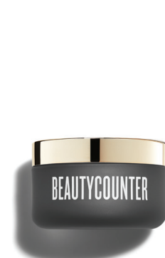
Lotus Glow Cleansing Balm $79 USD | 103 CAD$

We've transitioned even more Counter+ products to glass so they're more likely to have a second life as new products.