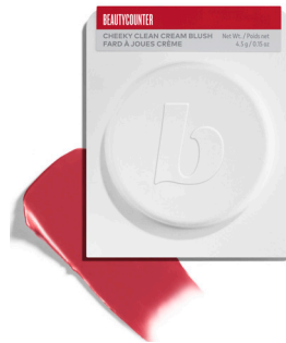
Cheeky Clean Cream Blush Refill $28 USD | 36 CAD$

How to refill: remove and recycle the empty refill (and swap it in for a new shade), and keep blushing it.