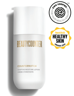
Countermatch Adaptive Moisture Lotion $54 USD | 70 CAD$

This lightweight lotion provides essential nutrition and oxygenation to keep skin soft and glowing for up to 24 hours of hydration.* SKU 100000458 / 100001025 50 ml / 1.7 fl oz