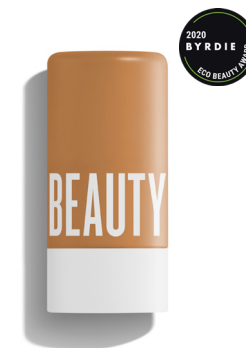
Dew Skin Tinted Moisturizer $50 USD | 62 CAD$

This lightweight lotion provides essential nutrition and oxygenation to keep skin soft and glowing for up to 24 hours of hydration.* SKU 100000458 / 100001025 50 ml / 1.7 fl oz