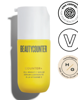
Counter+ All Bright C Serum $90 USD | 117 CAD$

This ultra-potent 10% blend of two forms of vitamin C instantly brightens skin and helps reduce the appearance of existing dark spots and protect against new ones.