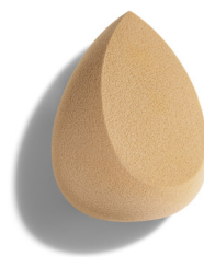
The Better Blender $22 USD | 29 CAD$

This triple-threat makeup sponge gives you a flawless finish from every angle.