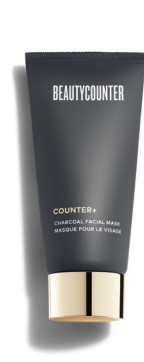
Charcoal Facial Mask $54 USD | 70 CAD$

This balm is a multitasking cleanser and overnight mask featuring a blend of lotus extract, jojoba seed oil, and avocado seed oil. SKU 100000343 75 ml / 2.5 fl oz