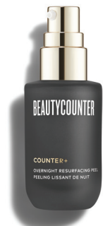
Overnight Resurfacing Peel $72 USD | 94 CAD$

Designed to help improve the appearance of skin radiance. Omega-rich marula oil provides intense hydration, while antioxidant vitamin C helps brighten and even skin tone. SKU 100000335 20 ml / 0.67 fl oz