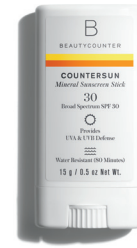
Mineral Sunscreen Stick SPF 30 $23 USD | 30 CAD$

This luxurious sunscreen lotion blends evenly and is water resistant. SKU 3042 / US ONLY 100 ml / 3.4 fl oz