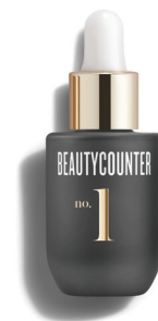
No. 1 Brightening Facial Oil $75 USD | 99 CAD$

Binchotan charcoal powder helps detoxify skin and absorb impurities (without dryness). This bar gives you a smoother, brighter complexion. SKU 100000439, 3027 85 g / 3.0 oz