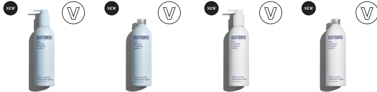
Daily Shampoo in Bright Grapefruit $29 USD | 38 CAD$

Refreshed for the whole family (and the planet). Now that's #betterbeauty for every body.