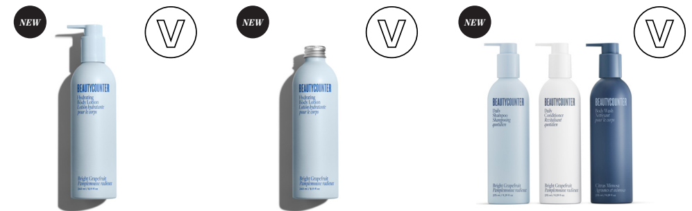
Hydrating Body Lotion in Bright Grapefruit $29 USD | 38 CAD$

A daily solution for the whole family—relieves, soothes, and calms dry, cracked skin. Packaged in a PCR resin tube.** SKU 100001093 85 g / 3 oz