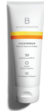
Mineral Sunscreen Lotion SPF 30 $43 USD | 54 CAD$

This continuous-mist sunscreen sprays on white, blends in easily, and dries quickly. SKU 3046 US / 3146 CAN 89 ml / 3 fl oz