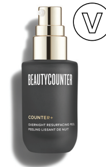
Counter+ Overnight Resurfacing Peel $72 USD | 94 CAD$

Featuring a proprietary multi-acid complex, this leave-on AHA/beta-hydroxy acid peel improves skin texture and boosts clarity without irritation or over-drying.