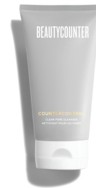
Clear Pore Cleanser $32 USD | 42 CAD$

Our signature SkinBalance Complex utilizes wintergreen and rosebay willow to mattify, clear breakouts, purify pores, and balance skin.