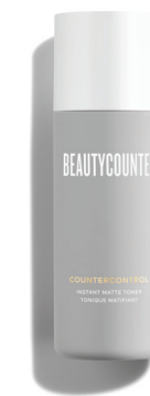
Instant Matte Toner $32 USD | 42 CAD$

This daily exfoliating cleanser effectively removes oil, makeup, and other impurities without harsh surfactants that can strip skin of moisture. SKU 100001024 150 ml / 5 fl oz