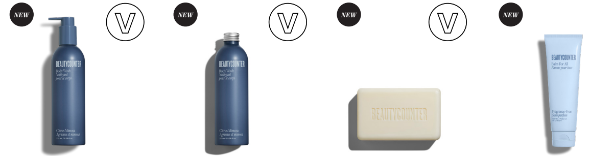
Body Wash in Citrus Mimosa $29 USD | 38 CAD$

This cleanser features a refreshing citrus scent, provitamin B5 and gentle surfactants with coconut-derived fatty acids to help cleanse and hydrate skin. Now in an aluminum bottle, with refills available. SKU 10000113 275 ml / 9.29 fl oz