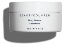
Body Butter in Citrus Mimosa $43 USD | 51 CAD$

Replenish moisture with shea butter and mongongo oil—leaving skin feeling soft and smooth. The formula blends easily into skin and absorbs quickly without feeling greasy. SKU 3037 130 ml / 4.4 fl oz