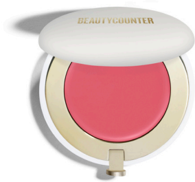
Cheeky Clean Cream Blush $42 USD | 55 CAD$

Versatile, multitasking, and mistake-proof, this silky cream color for cheeks (and lips) gives you a dewy, smooth finish thanks to skin-loving ingredients like squalane.